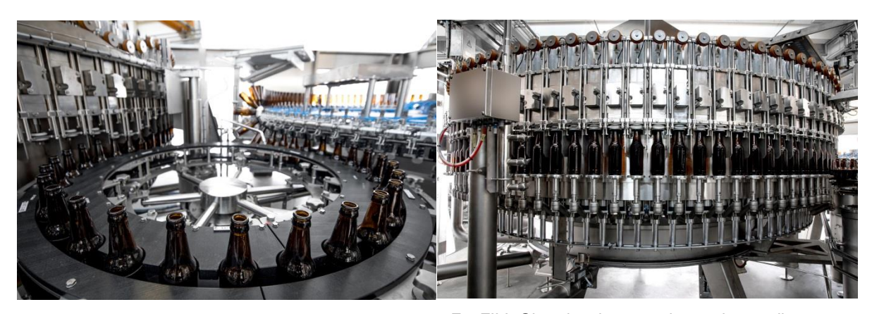
The re-designed handling parts, which are now lighter and smaller, ensure a changeover time shorter than 30 minutes with one operator.

More information on Sidel EvoFILL Glass: sidel.com/evofillglass.