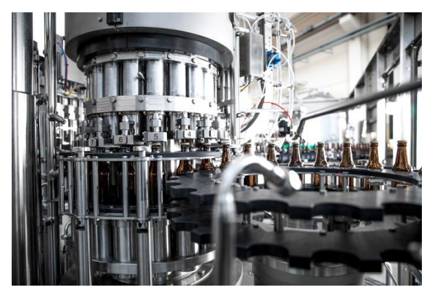
The ultra-clean crowner manufactured by Sidel, with its open design and off-set crowning ring, adds further performance to the bottling process with no internal lubrication needed.